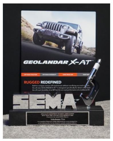
Winner of the award for Best New Tire GEOLANDAR X-AT (left) and its trophy